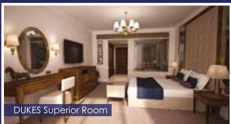
DUKES Superior Room