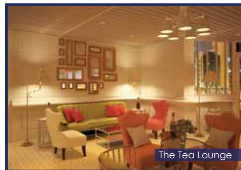
The Tea Lounge