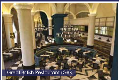
Great British Restaurant (GBR)