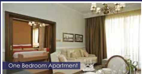
One Bedroom Apartment